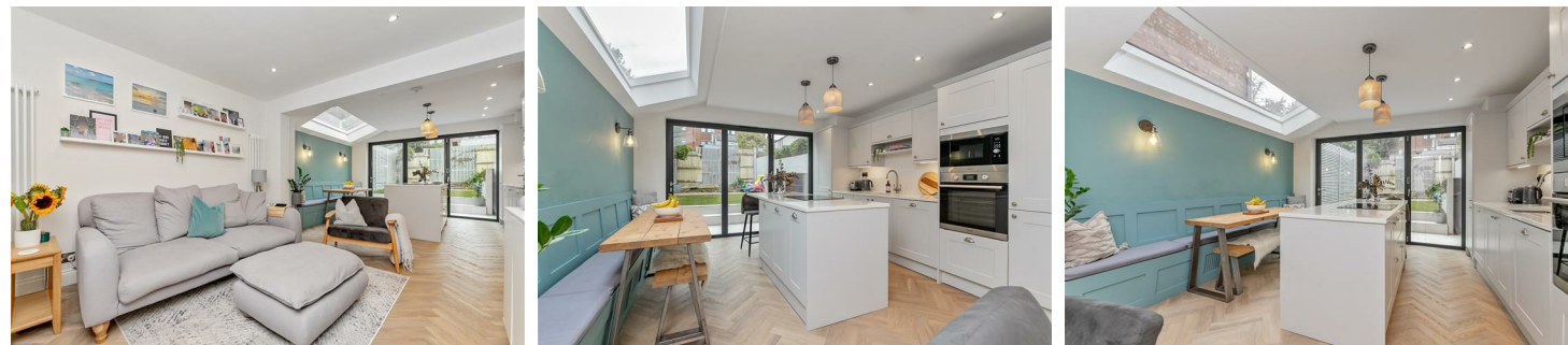
Ground Floor Approx. 484.8 sq. feet

Beautifully presented bright and spacious extended three bedroom Victorian terrace home set in the heart of St. Albans. This property will appeal to the busy professional, commuter or family who are looking for city centre living, good restaurants, plenty of outdoor places for leisure and socialising, excellent schools and easy access to the two stations, linking St. Albans to London in approximately 30 minutes. Accommodation is arranged over two floors with a hallway leading through to the open plan recently extended kitchen dining living area with bi fold doors to the rear garden. Glazed doors also open to the front sitting room with a feature fireplace and bay window. There is also the benefit of a downstairs cloakroom. Off the first floor landing can be found three bedrooms and a family bathroom. There is also passed planning for a loft conversion comprising a bedroom with en suite. Outside there is a private screened rear garden offering a high degree of privacy. EPC rating D.